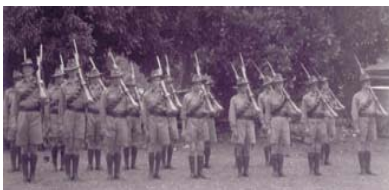
NGVR on parade, Rabaul 1940

The headquarters of the NGVR was originally at Rabaul and sub-units were located at Wau, Salamaua, Lae and Madang. Fit men between the ages of 18 and 50 were accepted. Enlistment was for a two-year period and there was no pay except for an allowance of 1 pound per year. The uniform consisted of khaki shirts and trousers, made from material sent from Australia. The Army supplied felt hats, bandoliers, leather belts, boots and puttees. Brass NGVR shoulder badges were worn. Arms consisted of rifles and some Vickers and Lewis machine guns.