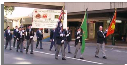
Reserve Forces Day March, July 2006