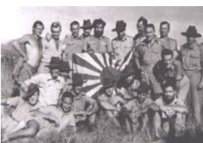
NGVR with captured flag, Wau 1942

The 2/5th Independent Company AIF, with supporting attachments, flew into Wau from Port Moresby on 23 May to reinforce NGVR. These units formed Kanga Force, whose role was to start a limited offensive to harass and destroy enemy personnel and equipment in the area. The OC Kanga Force considered there were 2,000 Japanese in Lae and 250 in Salamaua. Kanga Force had 700 men, of whom only 450 were fit for operations - a small number to meet the many possible Japanese threats. To forestall these, the OC ordered raids on Salamaua and Heath's Plantation west of Lae. The Salamaua raid was planned quickly as a result of previous scouting work. Early in the morning of 29 June,