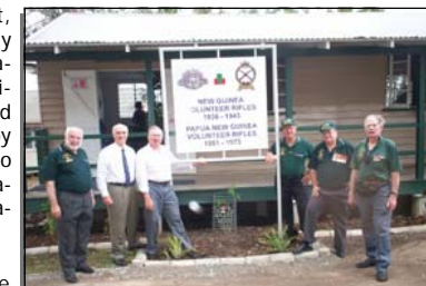
Six of the hard workers on Opening Day, 12 February 2006

You are invited to donate or loan appropriate items to the Museum, with the knowledge they will be properly and securely looked after. Also please do not forget to make a bequest to the NGVR/PNGVR Museum in your will.